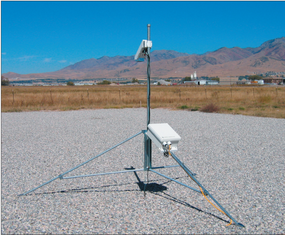
The CS110 is designed for easy attachment to a tripod or tower (shown attached to a CM10 10 ft steel tripod).

The CR1000's on-board programming language, CRBasic, provides data processing and analysis routines that support user control over sample (measurement) rates and setting of alarm conditions. LoggerNet Datalogger Support Software facilitates programming, communications, and data retrieval between the CS110 and a PC.